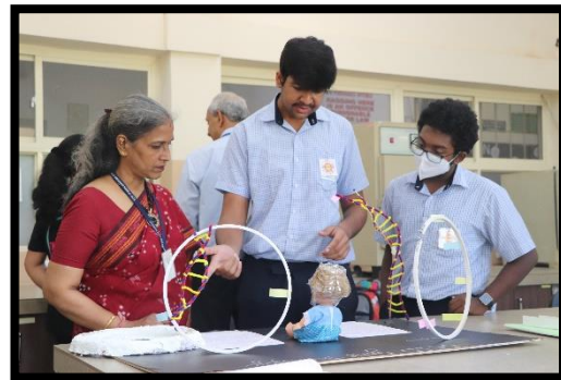
Dream it Built it (Event of Chiasma 8.0)