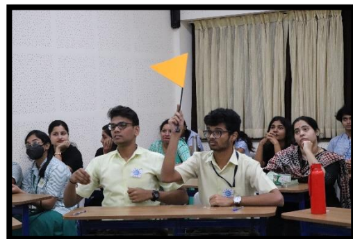
Biology in your nerves (Event of Chiasma 8.0)