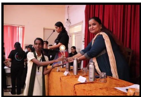
Winner of Dream it, build it