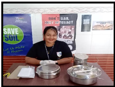
Food Stall at Chiasma 8.0