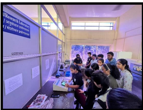
TY Biotechnology students explaining the instrument