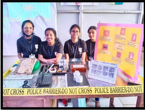
Forensic Science Exhibition