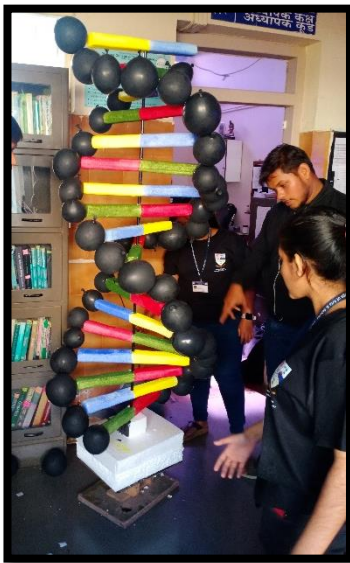
Rotating DNA model