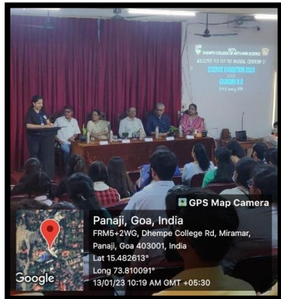
Inaugural Function of Chiasma 8.0