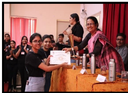
Winners of best Exhibit Chiasma 8.0