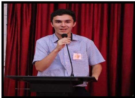
Student participant's feedback