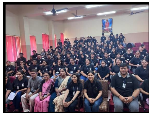
Operon Club of Biotechnology with Principal