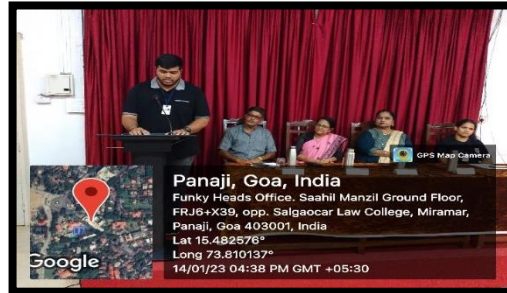
Valedictory Function of Chiasma 8.0