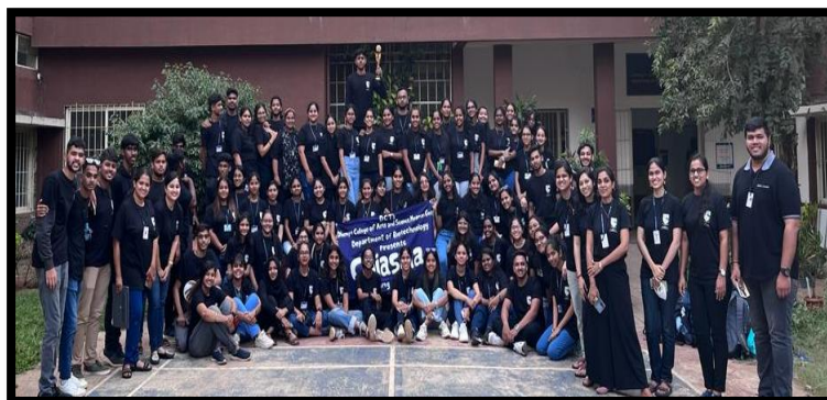
Biotechnology teachers and students of batch 2022-23