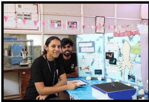
Exhibit on Bioluminescence