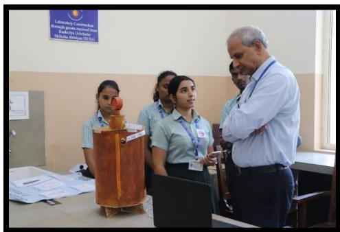
Dream it Built it (Event of Chiasma 8.0)