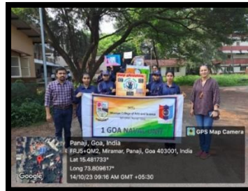
Rally on Gender Equality on 14.10.23.