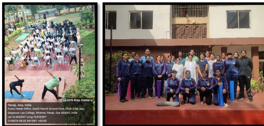
Yoga Day -21.06.2023