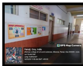
Display of Posters on 13.10.2023-14.10.2023