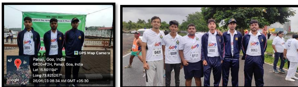
Goa Police Run against Narcotic drugs on 26.06.2023