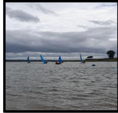
National Junior Ranking (sailing) Event, 19.07.2023-27.07.2023.