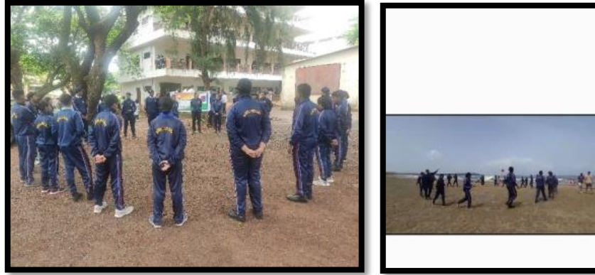
Street Play "Save Waterbodies"