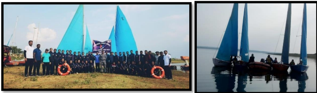
AIYR Camp 2.10.23-21.10.23