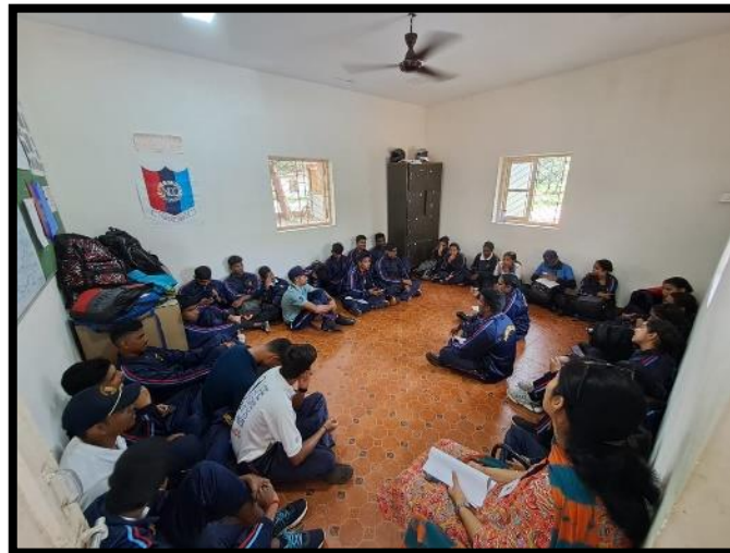
Debate Competition on " Role of Youth in Environment Protection"