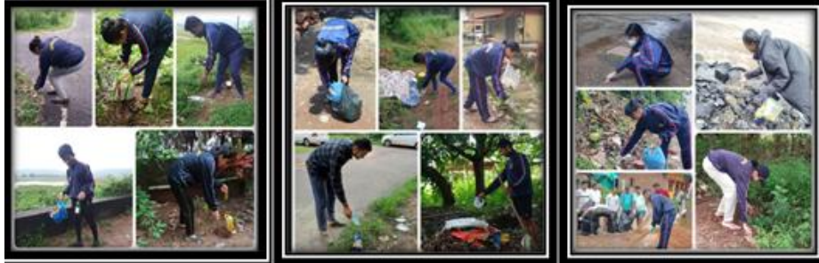
Cleanliness Drive on 02.10.2023