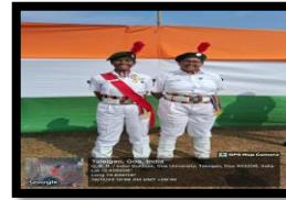
Goa Liberation Day Parade-19.12.2023.