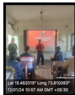
Debate Competition on “ Skill Development, Role of Youth Environment Protection ”