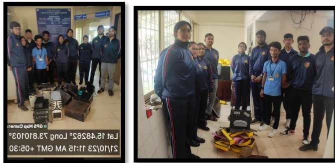
Campaign 3.0 Institutionalising Swachhata and minimizing conduct"