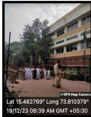
Goa Liberation Day Celebration-19.12.2023