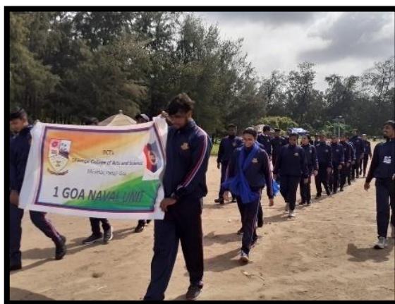
Awareness Rally "Save Water, Save Life" on 12.08.23