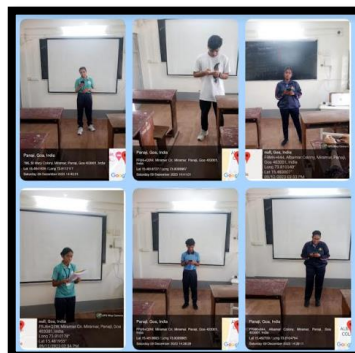
Cadets reciting poem