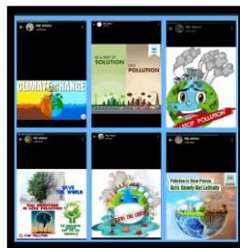
Whatsapp status -Control Pollution