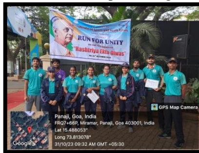
"Run for Unity " 31.10.23