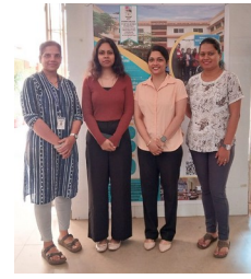
Session by University of York on 28 th March 2025