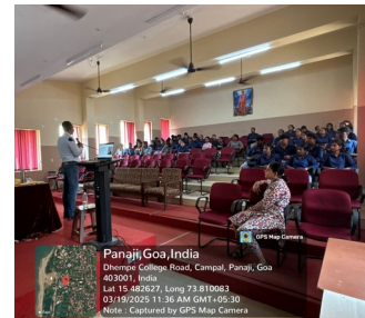
Talk by Tantulum Academy on 19 th March 2025