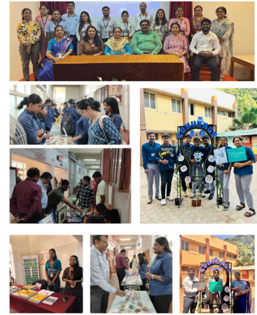
Converge 2.0 organised at the College on 7 th March 2025