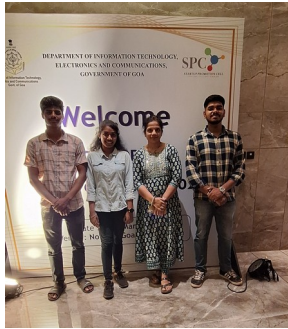
Launch of Goa Open Innovation Challenge 2025 on 28 th March 2025