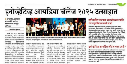
Converge 2.0 Valedictory on 13 th March 2025